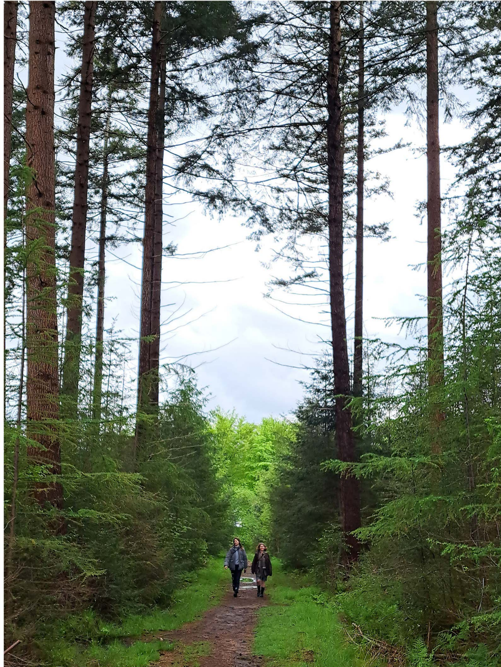
part 54 or: reel real pul, and this part is no longer ly handy here, 2024 studio documentation