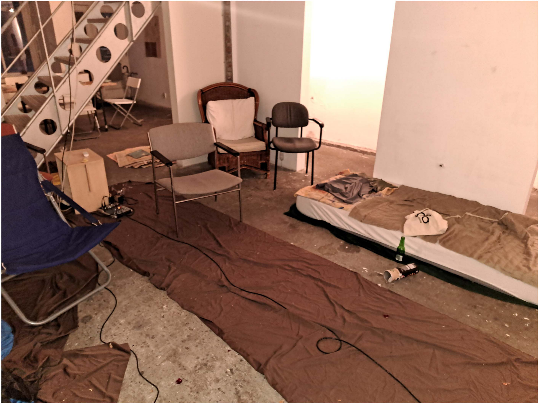
part 54 or: reel real pul, and this part is no longer ly handy here, 2024 studio documentation