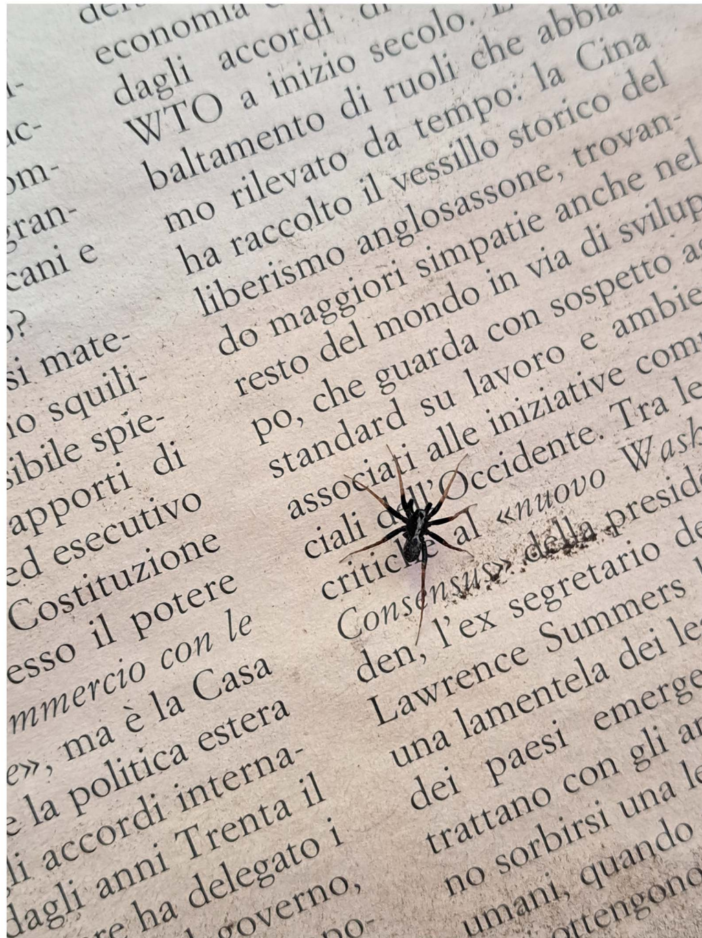
part 54 or: reel real pul, and this part is no longer ly handy here, 2024 studio documentation