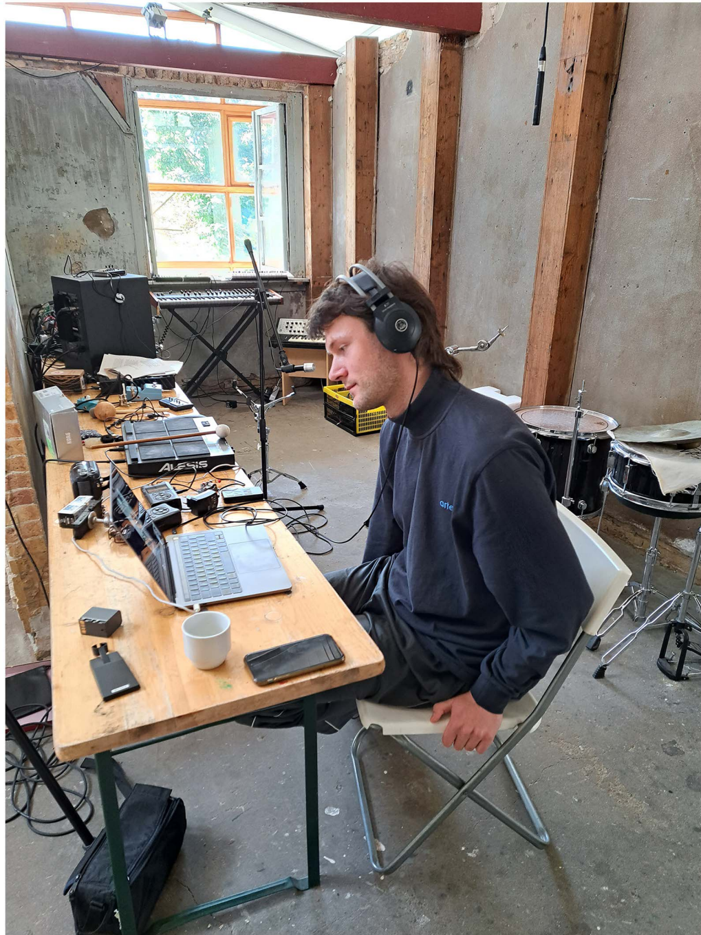
part 54 or: reel real pul, and this part is no longer ly handy here, 2024 studio documentation