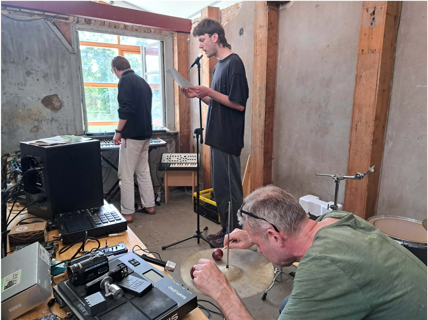
part 54 or: reel real pul, and this part is no longer ly handy here, 2024 studio documentation