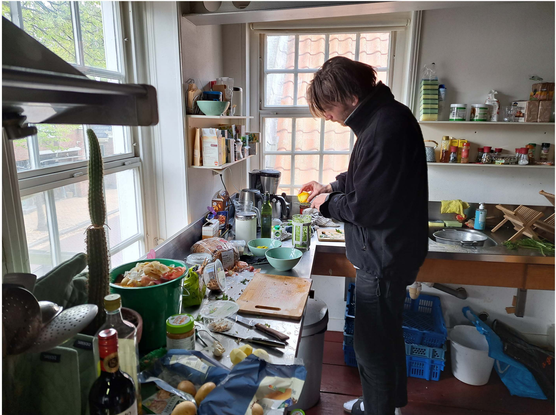
part 54 or: reel real pul, and this part is no longer ly handy here, 2024 studio documentation