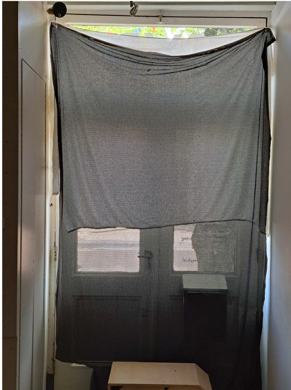
part 54 or: reel real pul, and this part is no longer ly handy here, 2024 studio documentation