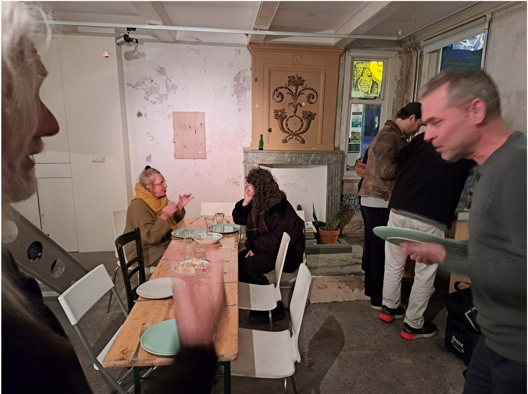
part 54 or: reel real pul, and this part is no longer ly handy here, 2024 studio documentation