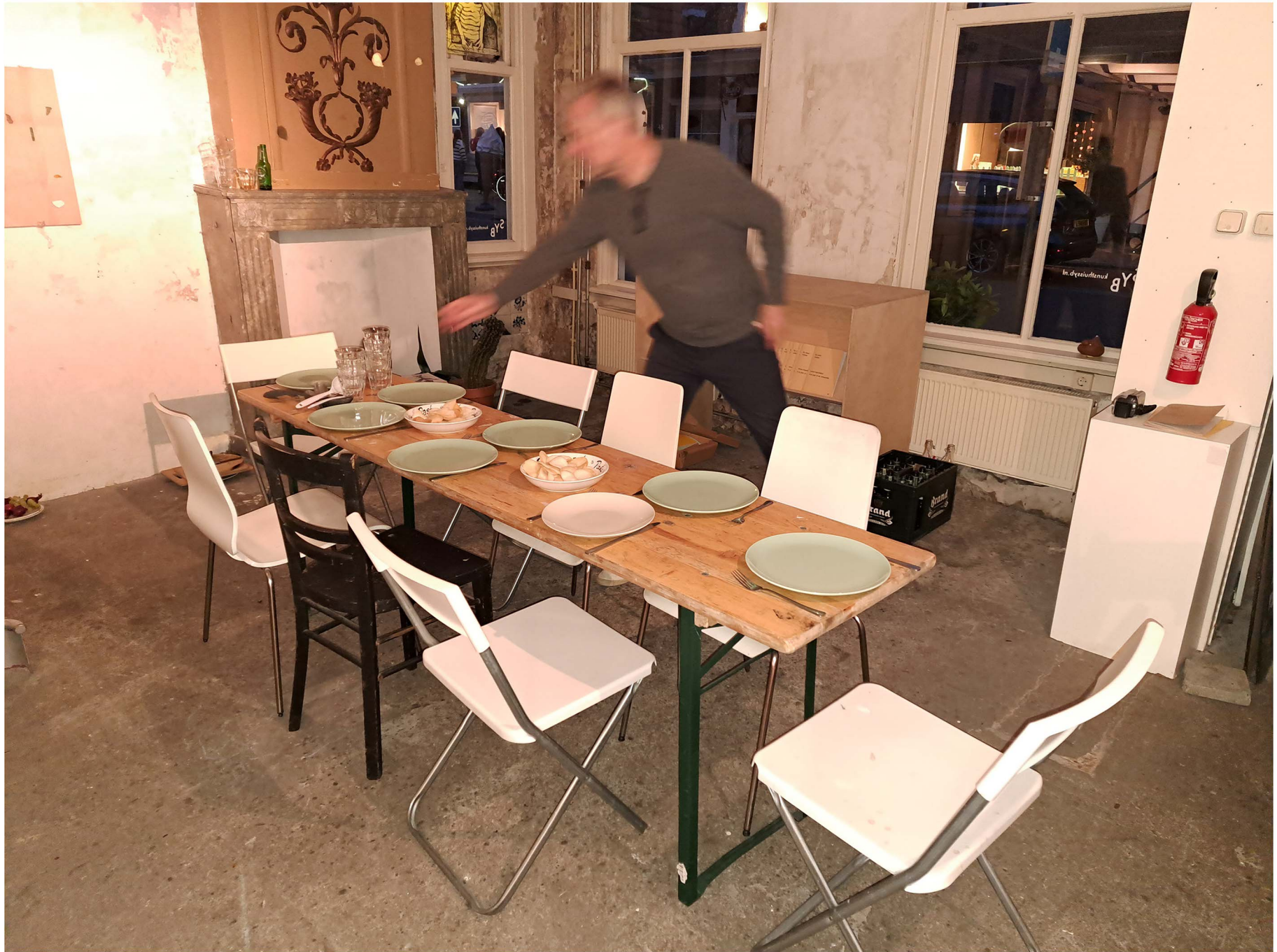
part 54 or: reel real pul, and this part is no longer ly handy here, 2024 studio documentation