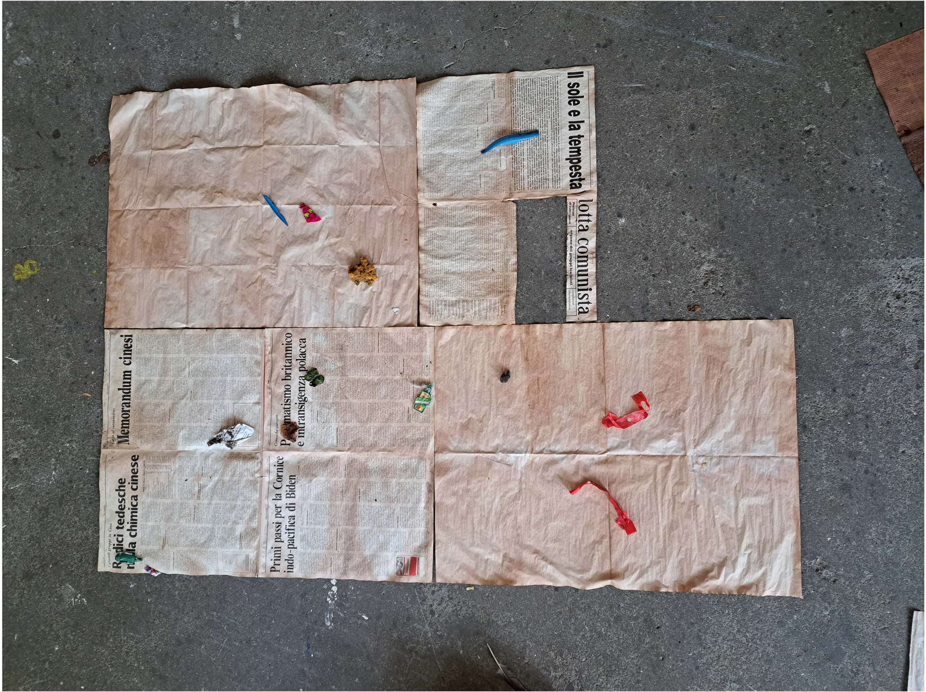
part 54 or: reel real pul, and this part is no longer ly handy here, 2024 studio documentation