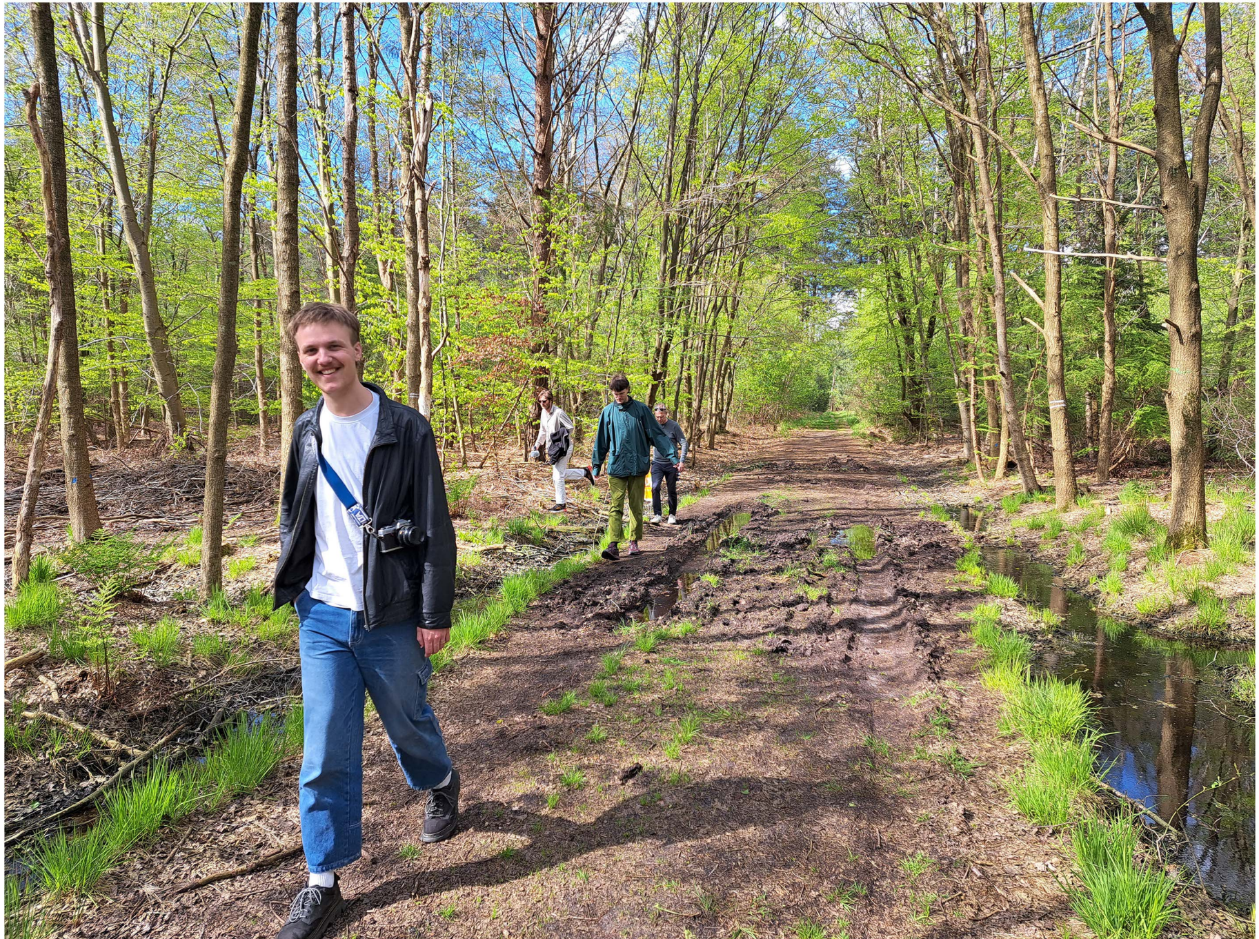
part 54 or: reel real pul, and this part is no longer ly handy here, 2024 studio documentation