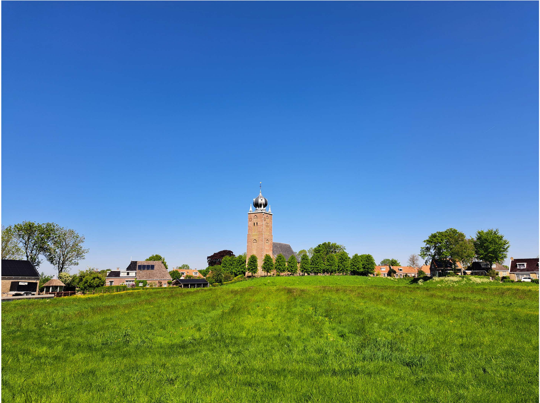
part 54 or: reel real pul, and this part is no longer ly handy here, 2024 studio documentation