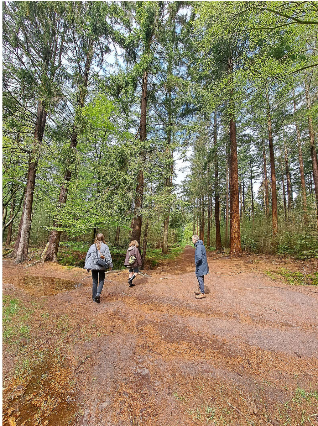
part 54 or: reel real pul, and this part is no longer ly handy here, 2024 studio documentation