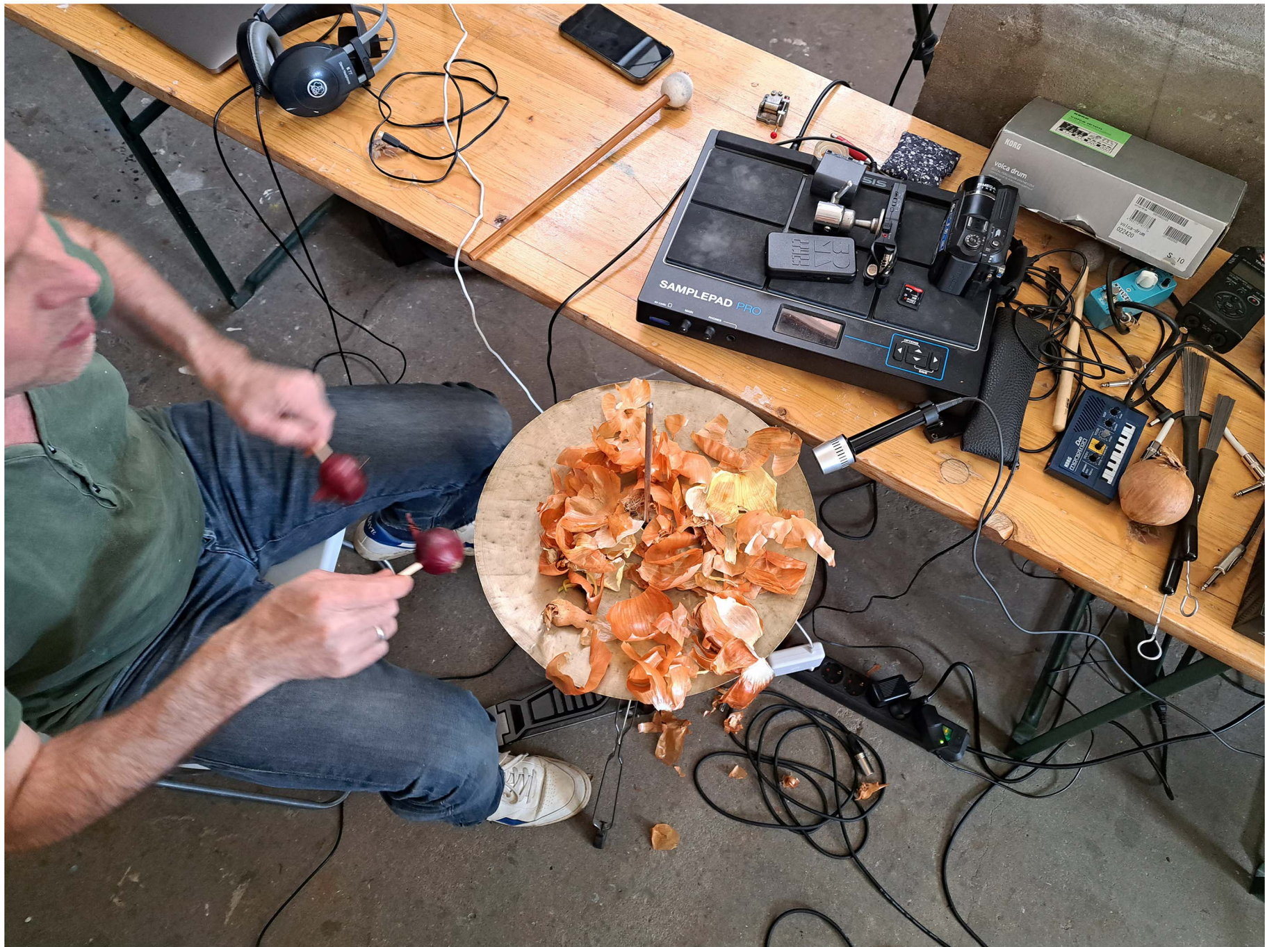
part 54 or: reel real pul, and this part is no longer ly handy here, 2024 studio documentation