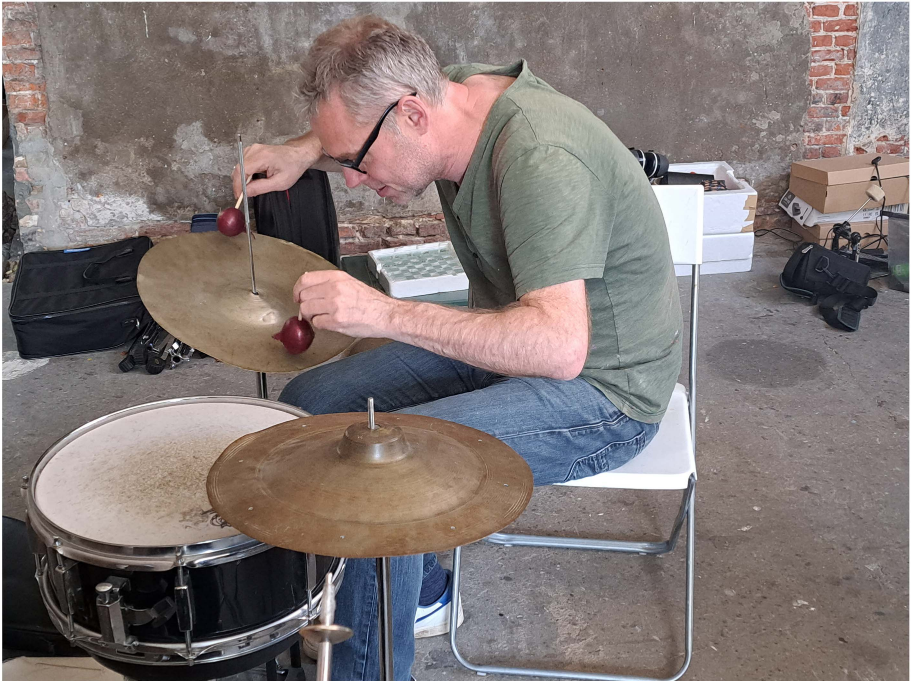
part 54 or: reel real pul, and this part is no longer ly handy here, 2024 studio documentation