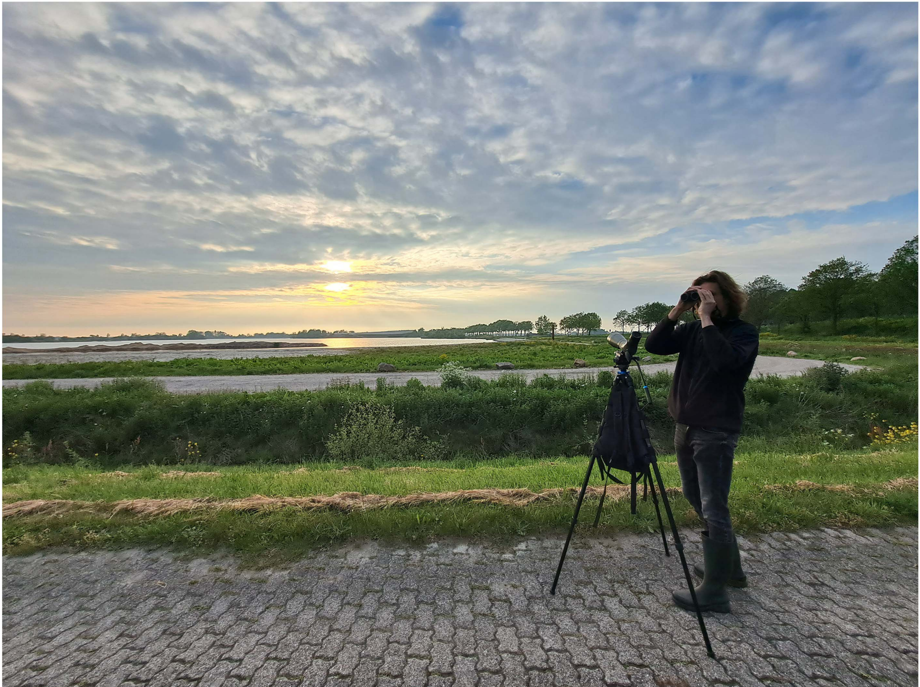
part 54 or: reel real pul, and this part is no longer ly handy here, 2024 studio documentation