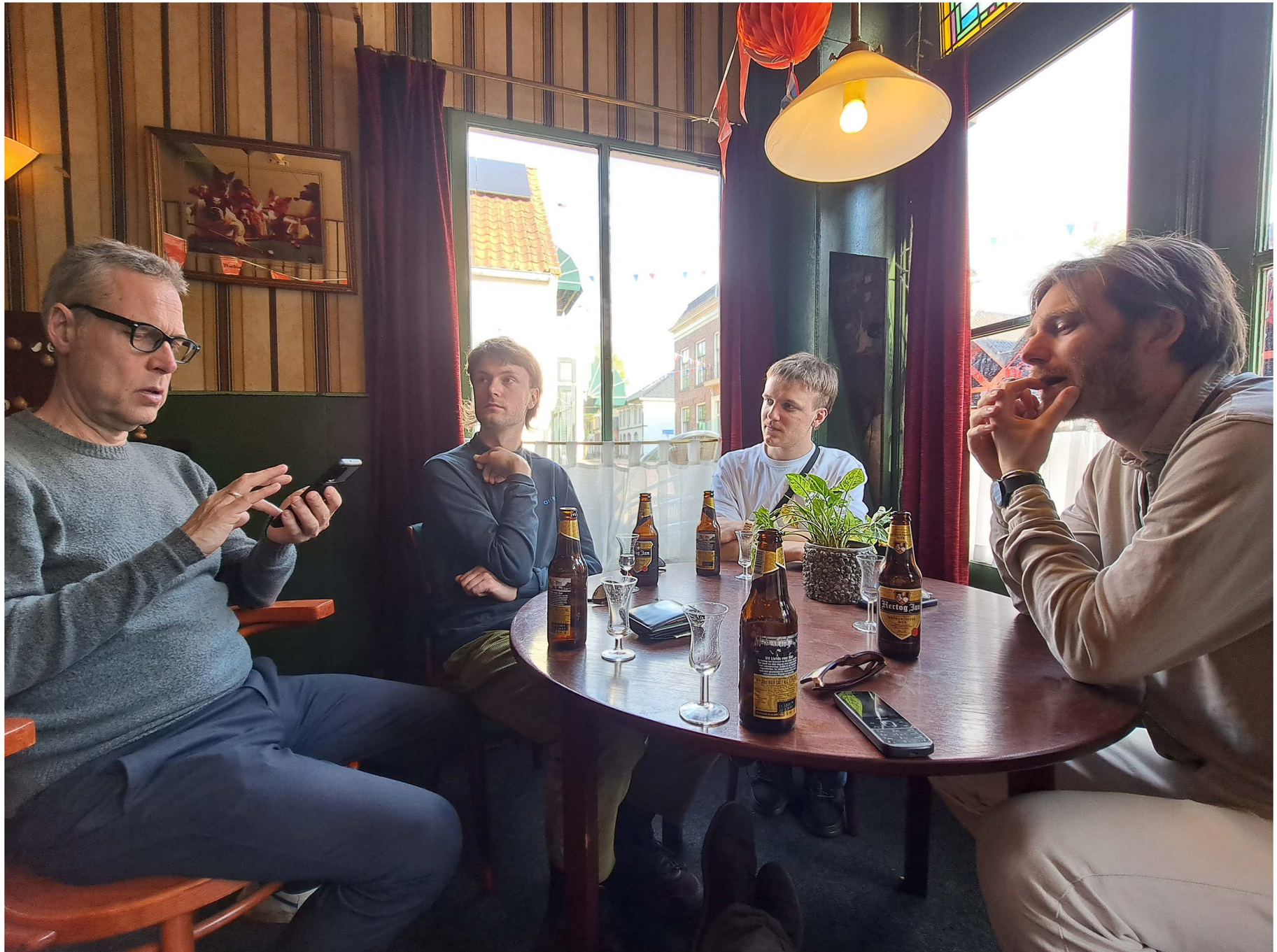
part 54 or: reel real pul, and this part is no longer ly handy here, 2024 studio documentation